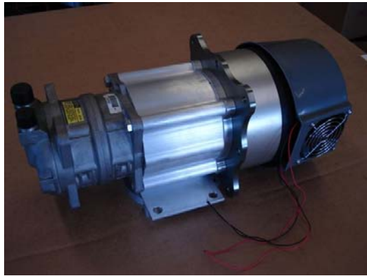
Electric motor drive with TM-13 compressor & CMG-1-06-36 motor

Low Voltage, High Efficiency Air Conditioning Compressor Low voltage, brushless motor operates directly from a battery pack.