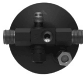
74R2546 Receiver/Drier $12.00