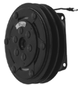
75R0452 12V, 2 Grv, Sgl Wire Clutch $55.00