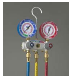
49847 Ritchie Titan R-134a Gauge Set $190.00