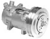
BT5-4510 12V 2 Groove Sanden Compressor $145.00