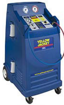
37880 Ritchie R-134a Recovery/Recycle/Recharge Unit with Vacuum Pump $3600.00 **SAE J2788 Approved**