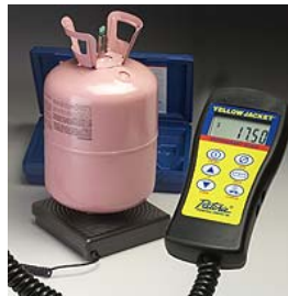
68802 Ritchie 110 lb Scale $225.00