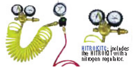
NITROKITG Nitrogen Kit with Regulator $175.00

ATCO Air-O-Crimp Complete your service truck and/or shop with the easy-to-use ATCO AOC fitting selection. No expensive crimper required – simply insert the fitting into the hose, slide on the clamp and crimp with an easy-to-use hand crimper!