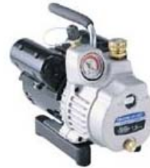
93515 Ritchie 6 CFM Vacuum Pump $490.00