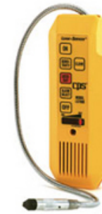
L-790 CPS Electronic Refrigerant Leak Detector $217.75